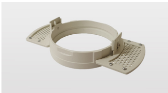
750+TL Trimless Kit Rear fitting, partial skim